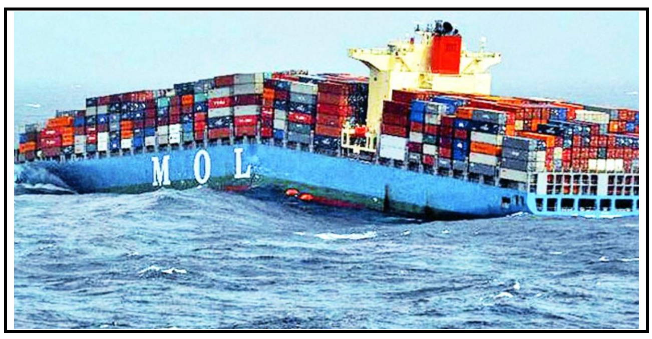
Exhibit 3: Buckled MOL Comfort Before Separation of Hull Sections

The 8110 TEU container ship MOL Comfort was constructed in Japan, owned by a Japanese firm, but registered in Bahamas. The ship experienced a compression and buckling at the lower midship hull while transiting the Indian Ocean in June 2015. At first, the two halves of the hull remained joined, as shown below in Exhibit 3. Within a few days, the actions of the sea on the vessel caused the two halves to separate and subsequently sink.