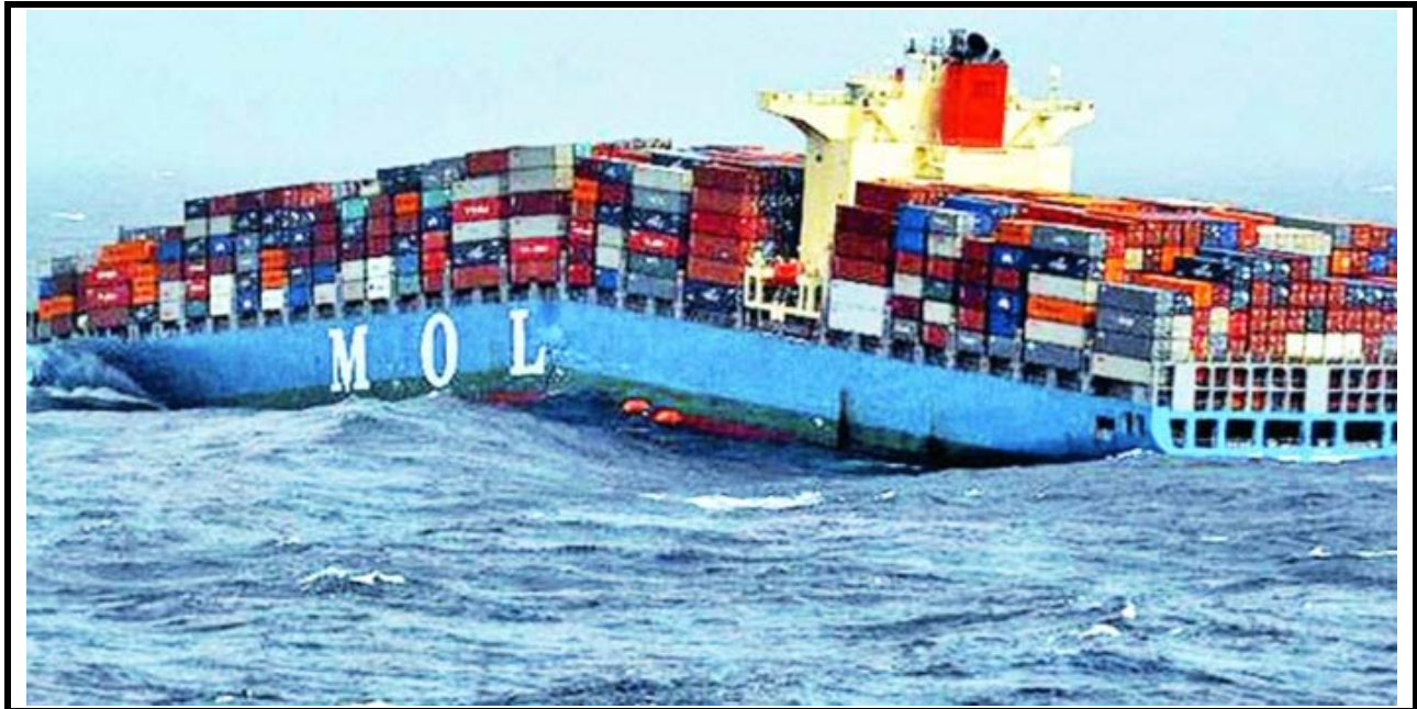
Exhibit 3: Buckled MOL Comfort Before Separation of Hull Sections

Close-up photos of the side of the still-joined halves of the hull show that the main deck remained connected, but that the double bottom had buckled, allowing the ship to take the shape shown in Exhibit 3. Analytical reports identifying the cause of the structural failure were performed by several organizations, including ClassNK that had classed the vessel continuously since its construction five years earlier in 2008. (Class NK 2014) (Bahamas 2020). Documentation during construction showed that the structure of the MOL Comfort had been in accordance with the intended design, including all structural components and their welded joints.